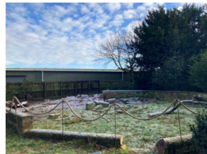
Results of the Aviary tree work